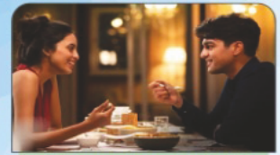
Guest Party Hall